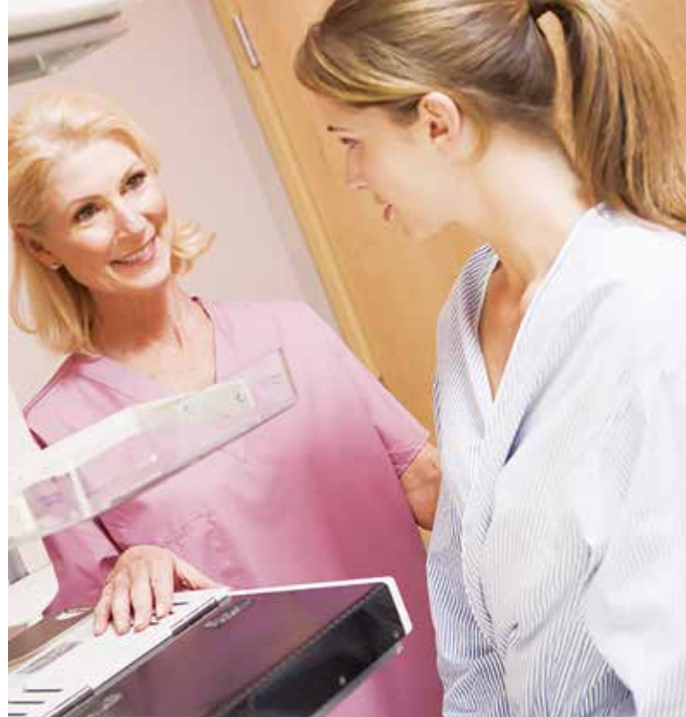
LEFT: 888 S. Rancho – Urgent Care open 24 hours a day/7 days a week RIGHT: Breast Care Program

Falls Prevention Program: This unique and comprehensive program, called Step by Step, helps older adults be aware of their chances of falling. Our healthcare team assesses older adults for falls, gait, and ability to move, and then provides assistance in the reduction or elimination of risks.